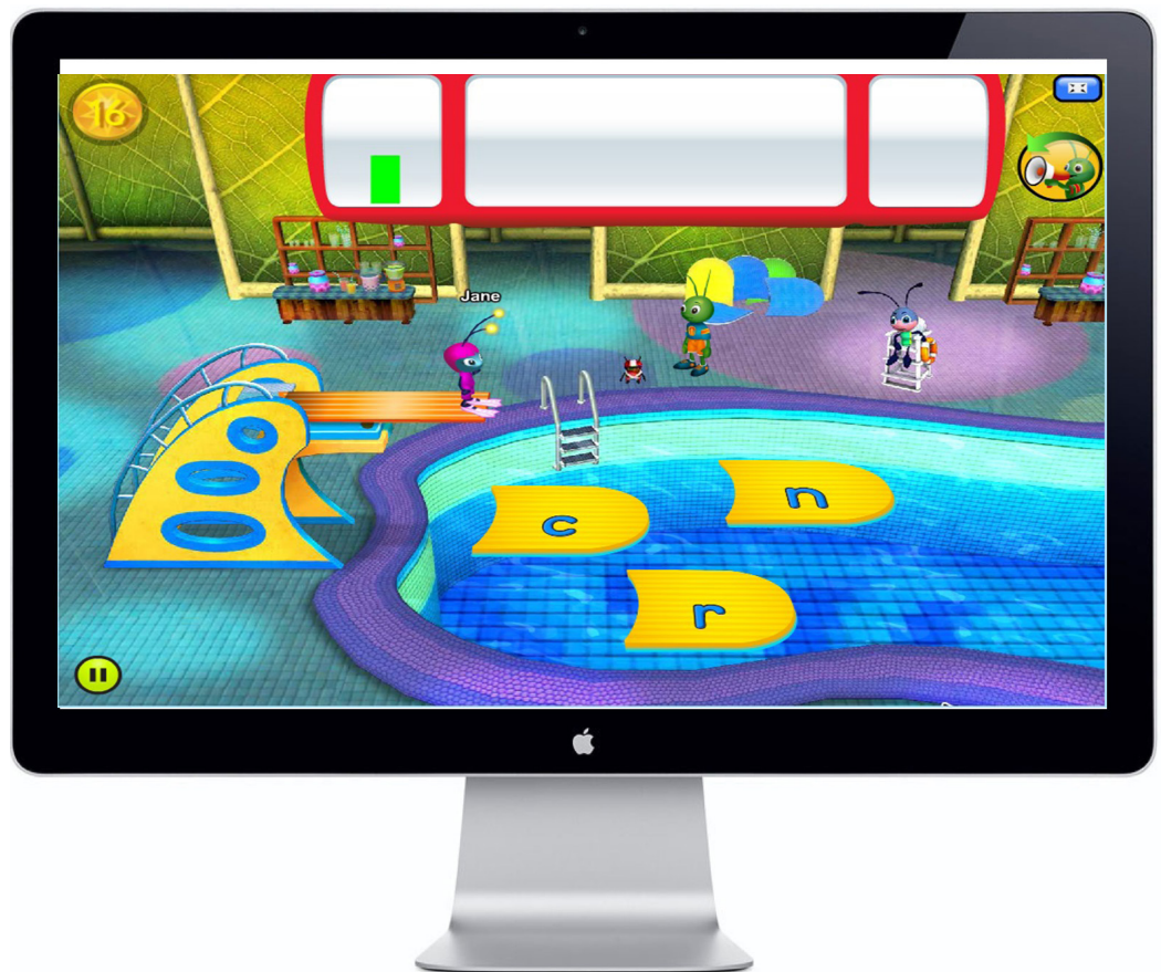
Figure 1 – The Assessment Pool is where each child is initially assessed for placement in the appropriately leveled learning environment.

Critical reviews of reading research, such as the one conducted by MacArthur, Ferretti, Okolo, and Cavalier (2001), highlight how technology can potentially teach phonological awareness and decoding skills, especially now that many software programs teach letter-sound correspondences and allow for the manipulation of sounds in words. This is of critical importance, considering that one of the main stumbling blocks that children experience in developing their reading abilities is based on the simple concept that words are composed of both immutable and malleable components that, depending on their arrangements, create new words. Lessons 3-69 in Smarty Ants have children watching and participating in the creation of words from sounds. This occurs concurrently with the teaching of sound-letter correspondences.